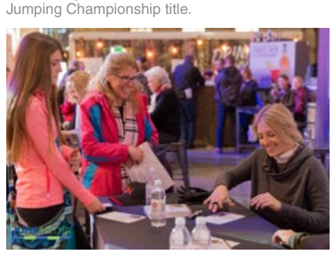
Canada's top-ranked female rider, Tiffany Foster, signs autographs for fans.